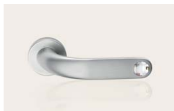
Cromo satinato satin chrome CS