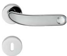
1596 RB 023