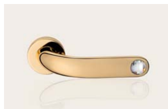
Oro zecchino gold plated OZ