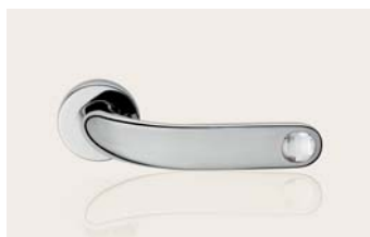
Cromo lucido polished chrome CR